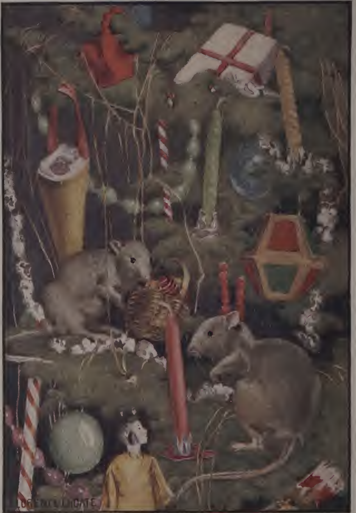
"THEY ATE UNTIL THEY COULD EAT NO MORE"—Page 3